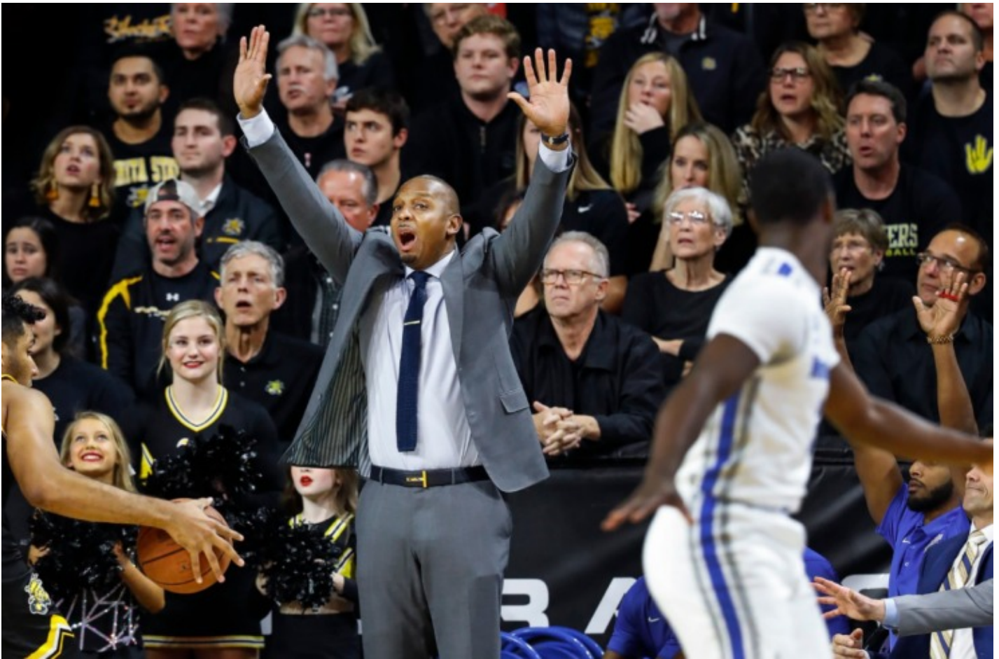
Memphis head coach Penny Hardaway (middle) calls for defensive presser during the Wichita State game.