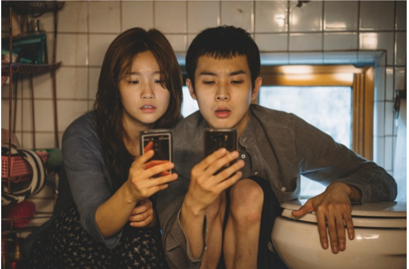
So-dam Park (left, as Ki-jung Kim) and Woo-sik Choi (Ki-woo Park) star in "Parasite."