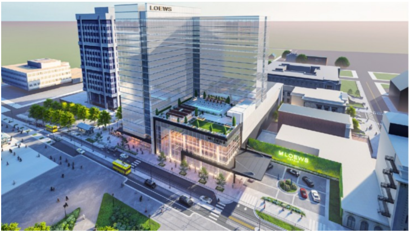
Proposed Loews Hotel in Downtown Memphis (Inland Pacific Companies)

Loews about to go high: Construction on the city's new, 16-story convention center hotel should begin in March. Loews received final approval for the project Wednesday from the Downtown Design Review board as well as City Council approval Tuesday for changes to the drop-off area. Quick. Someone get a "before" picture of the Main Street Mall; it's never going to be the same.